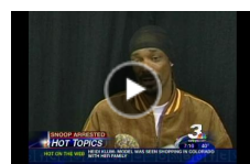
Hot Topics: Snoop Dogg detained