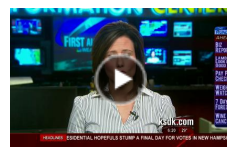
What to do if you are burned out